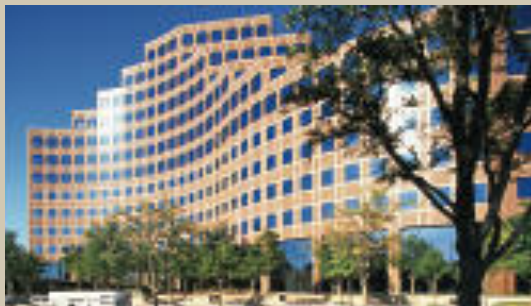
The Mary Kay Inc. World Headquarters in Dallas, Texas